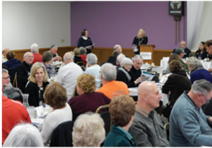
2018 WCCU Annual Meeting